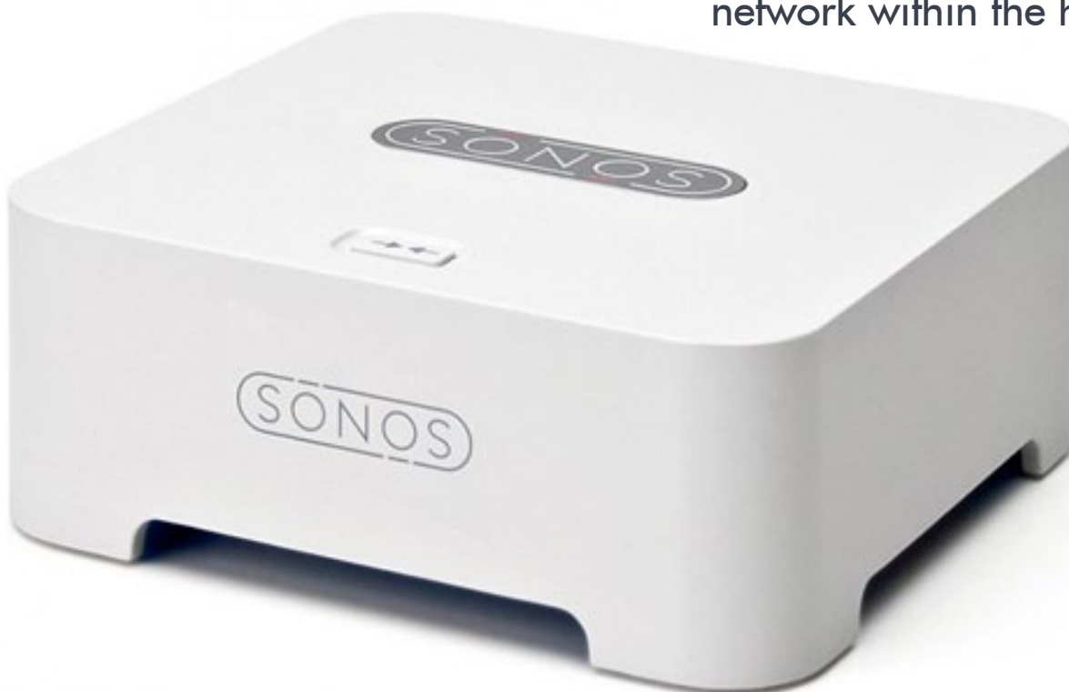
SONOS BRIDGE $49

The BRIDGE allows you to place the PLAY Series in a location that does not have a router or ethernet cable. The system is based on a wireless mesh network. The PLAY products and CONNECTs are mesh "nodes." The products communicate across this network, through the separate nodes. By adding the BRIDGE and each PLAY product, you are extending your network within the home.